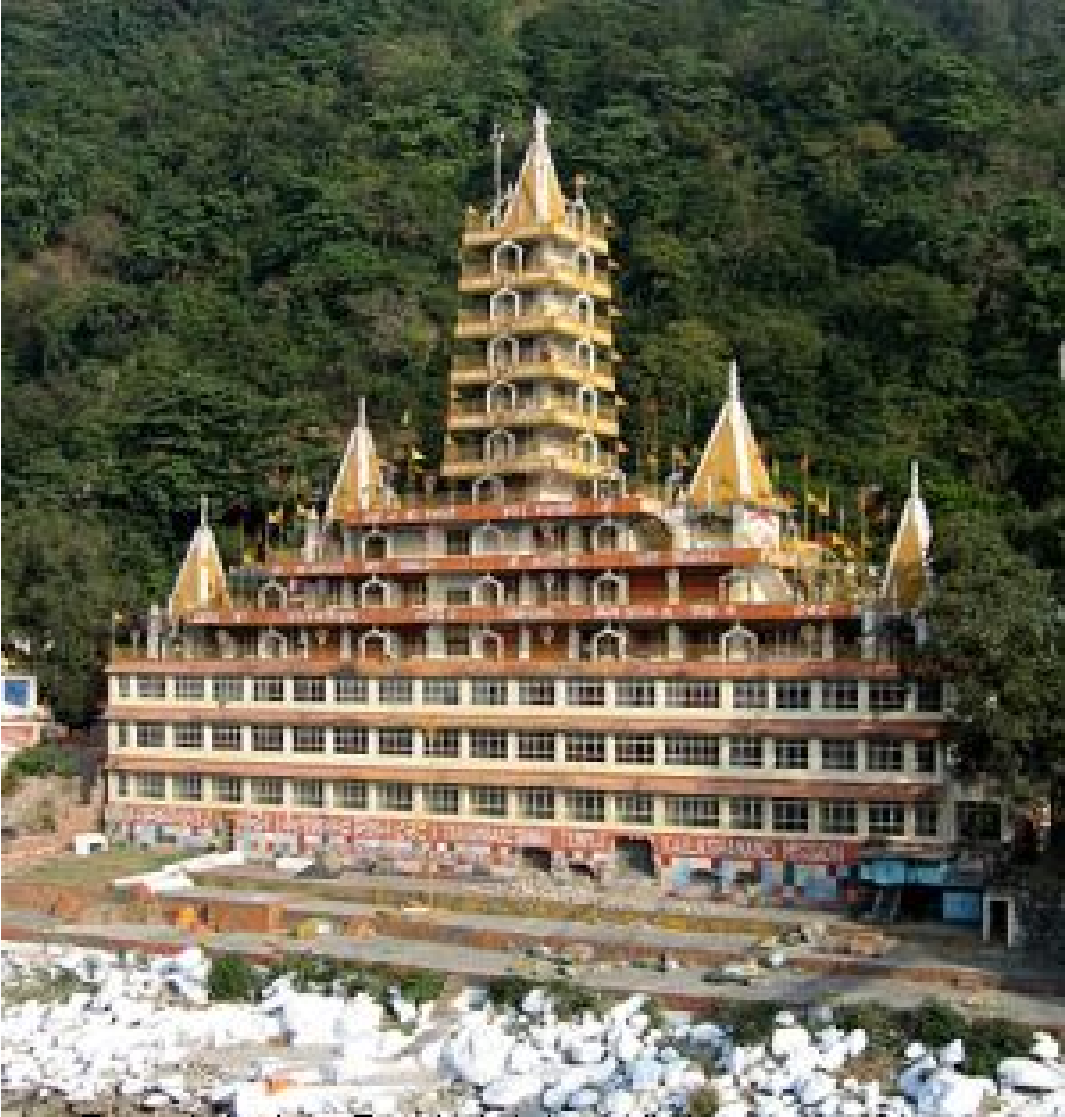
Education in Rishikesh, India. A school building with a golden spire, situated on a hillside. The foreground is filled with white plastic bags, suggesting a waste management or recycling site. The background is a dense green forest.